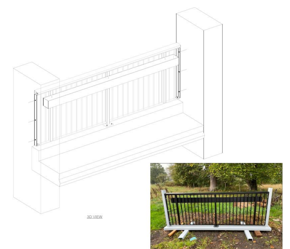
Figure 4 Proposed Balustrade